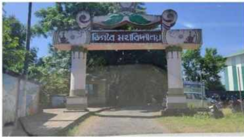
The entrance to the biodiverse Digboi college in Upper Assam's Digboi town.

India has quite a few biodiversity-rich educational campuses: from IISc, Bengaluru to IIT, Mumbai, home to a host of wildlife. Digboi College, however, is more than that.