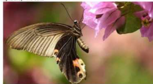
Digboi College is home to more than 100 species of butterflies. Pictured is the 'Paris Peacock'.

Digboi College, however, is more than that. It shares its boundary with the Upper Dihing Elephant Reserve, and it is barely 22 km from the recently notified Dehing Patkai National Park. Another forest is even closer: the Soraipung range under Digboi Forest Division, one of the entry points to the national park, is barely 6 km from the college. Rajib Rudra Tariang, who heads the zoology department at the college, spelled out the vastness of fauna spotted on campus over the years: "We have identified 19 species of mammals, 180 species of birds, 33 species of snakes, 12 species of lizards, 167 species of butterflies, seven species of frogs, more than 300 species of moths and several other species of insects and spiders," he said