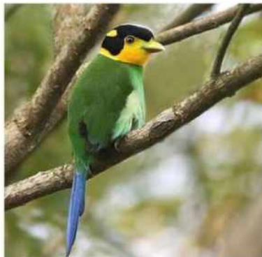
A long-tailed broadbill sighted on campus.

"Till then, I was sitting outside. After seeing the tiger, I remember coming inside the house and locking the grill," he recalled.