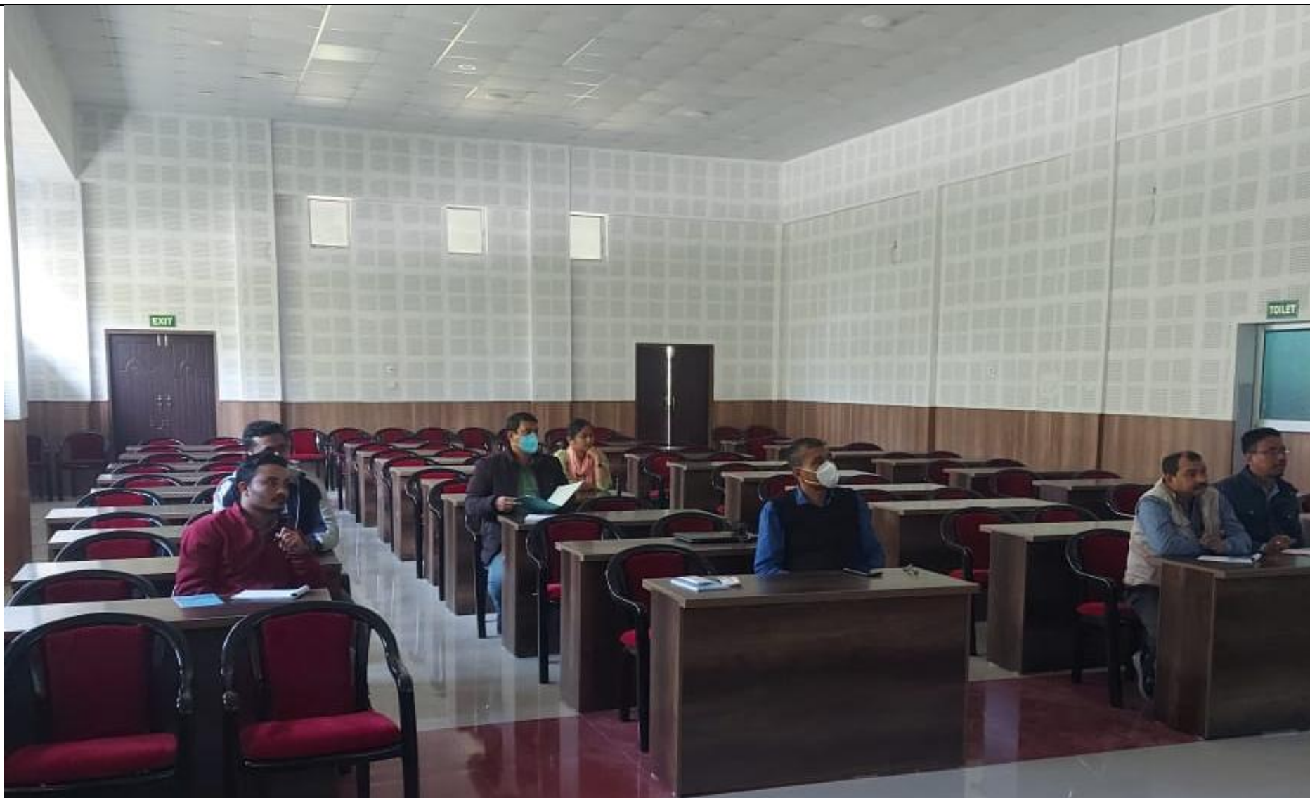
ERP for Non-Teaching Staff by KBQUBE on 30 th November, 2021