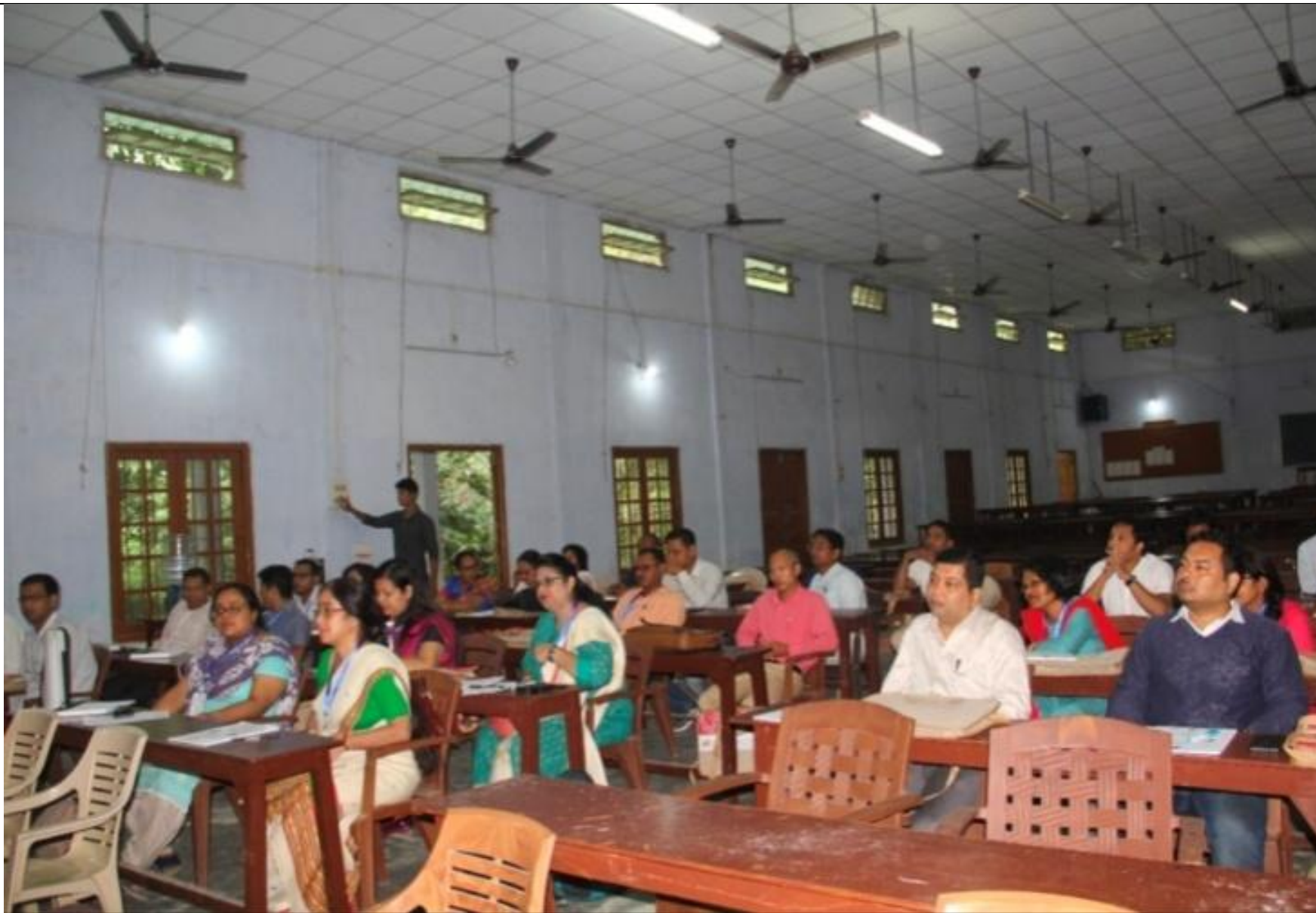
MENTORING PEDAGOGY AND EFFECTIVE LEARNING TECHNIQUES USING ICT (04-08 Nov, 2019)