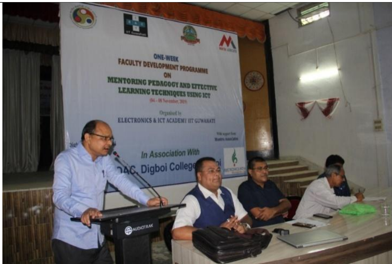
MENTORING PEDAGOGY AND EFFECTIVE LEARNING TECHNIQUES USING ICT (04-08 Nov, 2019)

One Week Faculty Development Programme on ‘MENTORING PEDAGOGY AND EFFECTIVE LEARNING TECHNIQUES USING ICT’ was organized with collaboration of E & ICT Academy, IIT Guwahati from 04-08 Nov, 2019 at the college auditorium with support from Mantra Associates. No of participants: 26