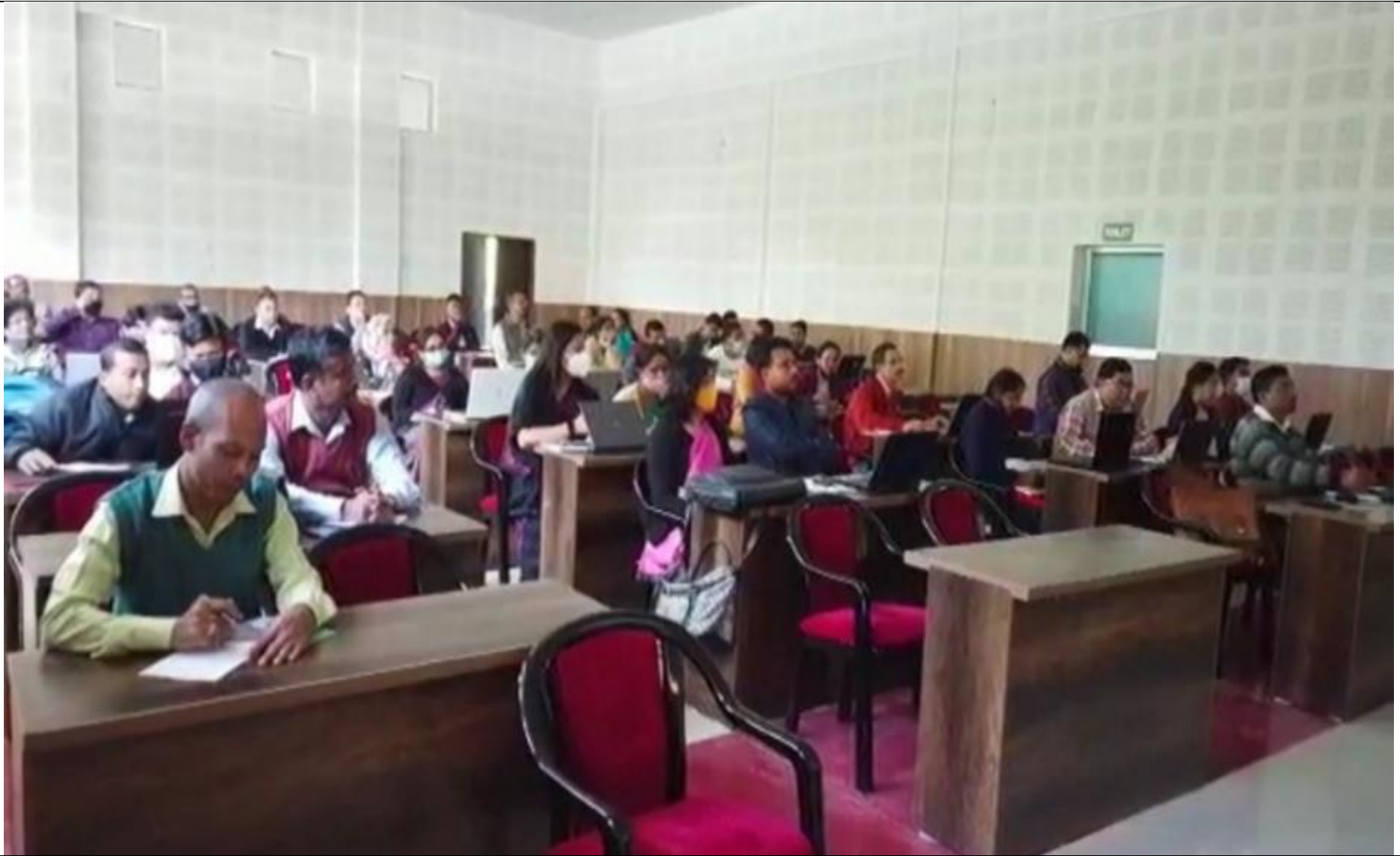
ERP for Teaching Staff by KBQUBE on 29 th November, 2021