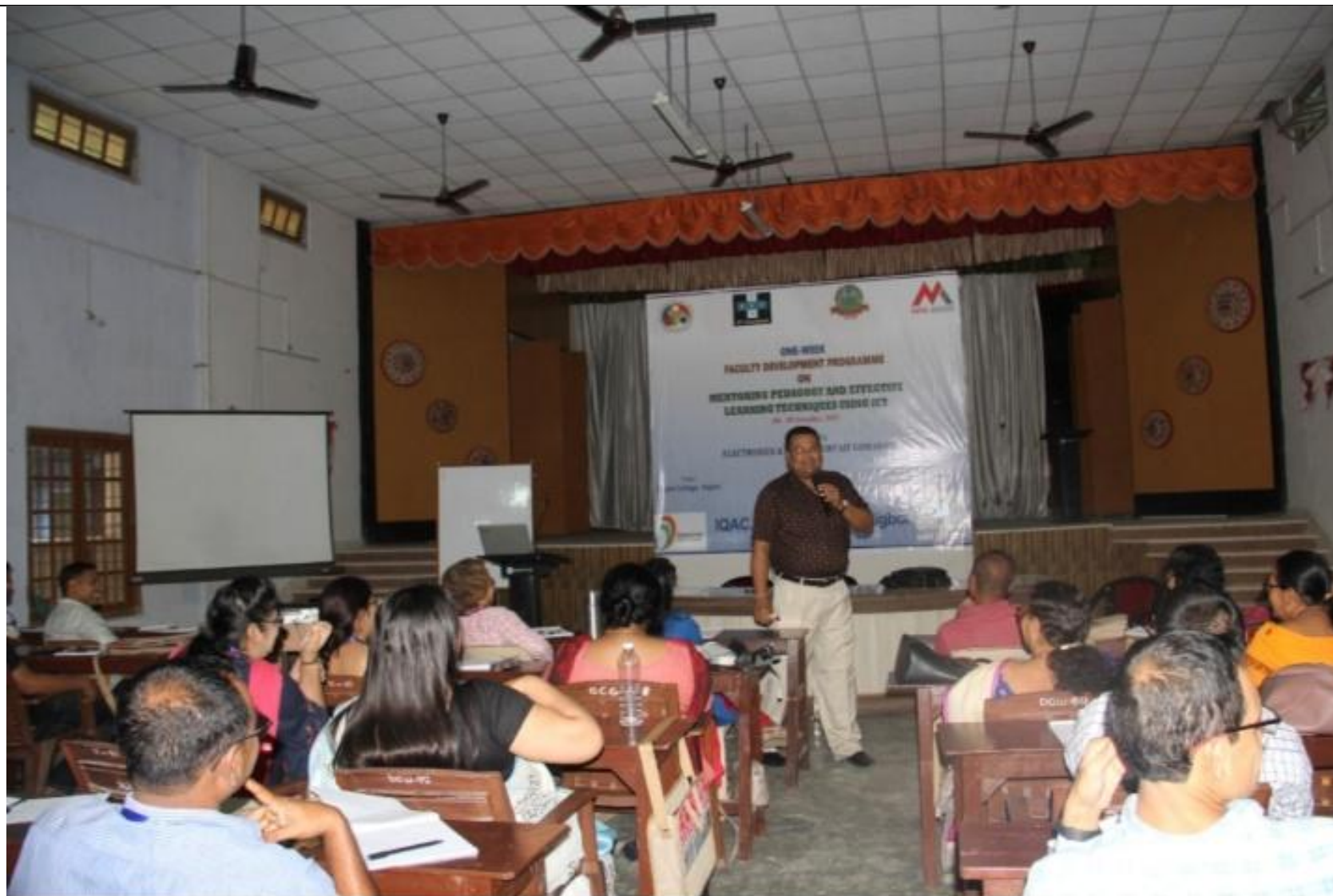
MENTORING PEDAGOGY AND EFFECTIVE LEARNING TECHNIQUES USING ICT (04-08 Nov, 2019)