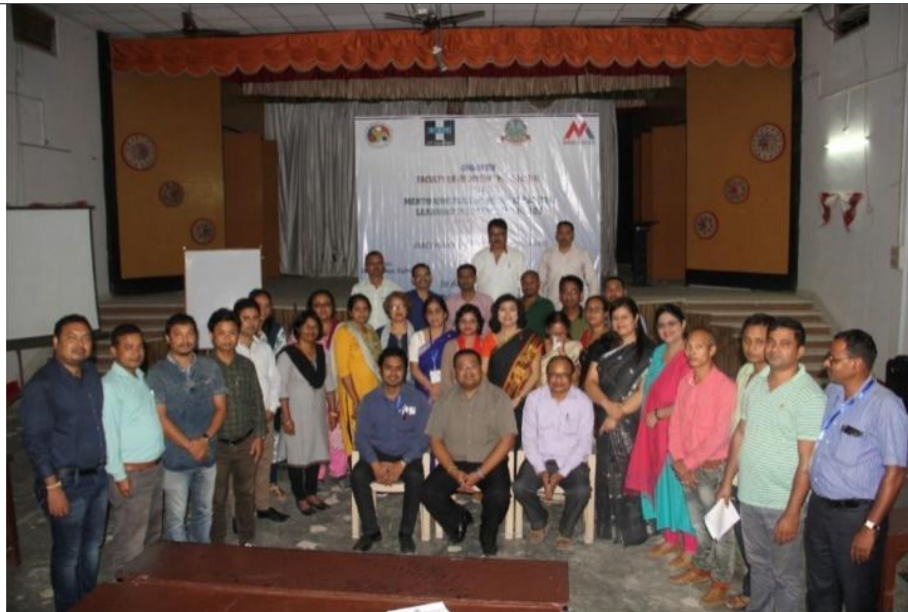
MENTORING PEDAGOGY AND EFFECTIVE LEARNING TECHNIQUES USING ICT (04-08 Nov, 2019)