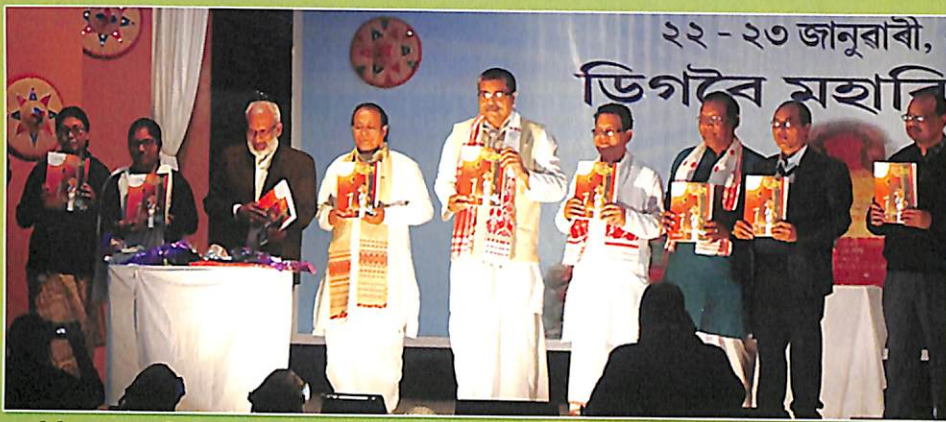
Digboi College Magazine, Issue-37 received the 'Best Magazine Award' at the Northeast College Magazine Competition organised by University of Science and Technology Meghalaya. The same magazine received 1 st prize at the Inter-College Magazine Competition organised by Dibrugarh University.