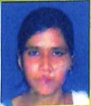
Mou Naha 1 st Class 97 th Position (Political Science)