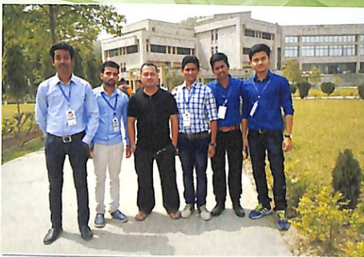
Five Students of B.Com 4 th Semester participated at the Research Enclave, 2017 organised by IIT, Guwahati from March 16-19, 2017.