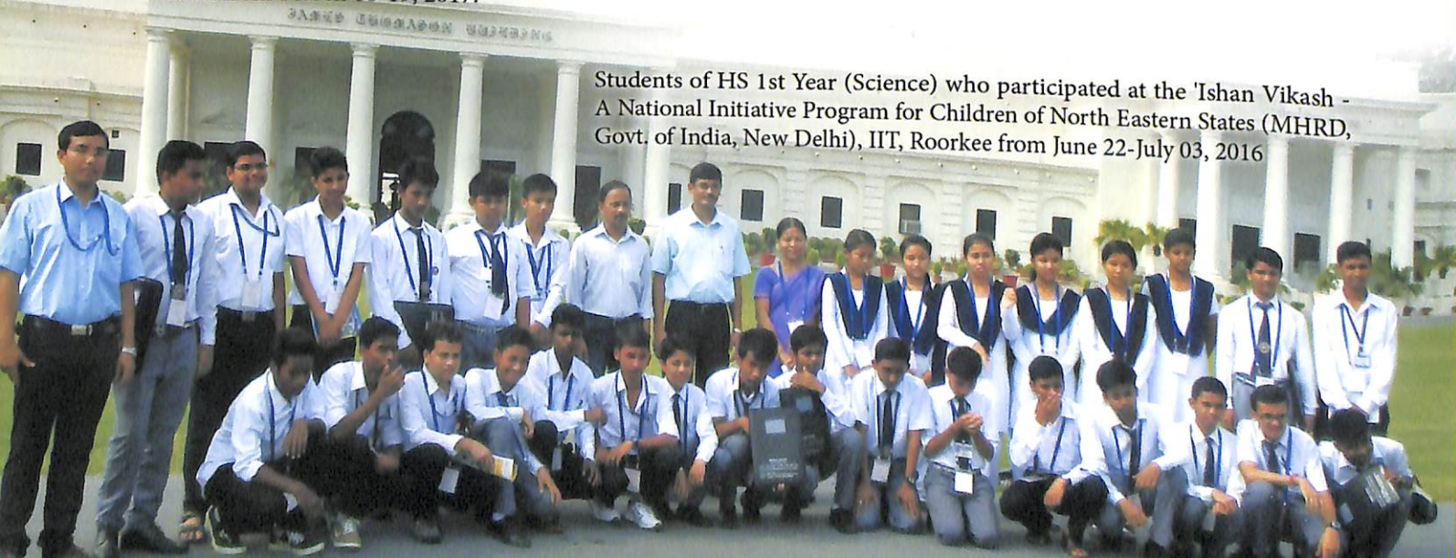
Students of HS 1st Year (Science) who participated at the 'Ishan Vikash - A National Initiative Program for Children of North Eastern States (MHRD, Govt. of India, New Delhi), IIT, Roorkee from June 22-July 03, 2016