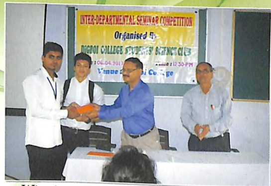
Winning team receiving awards at the Inter-departmental Seminar Competition