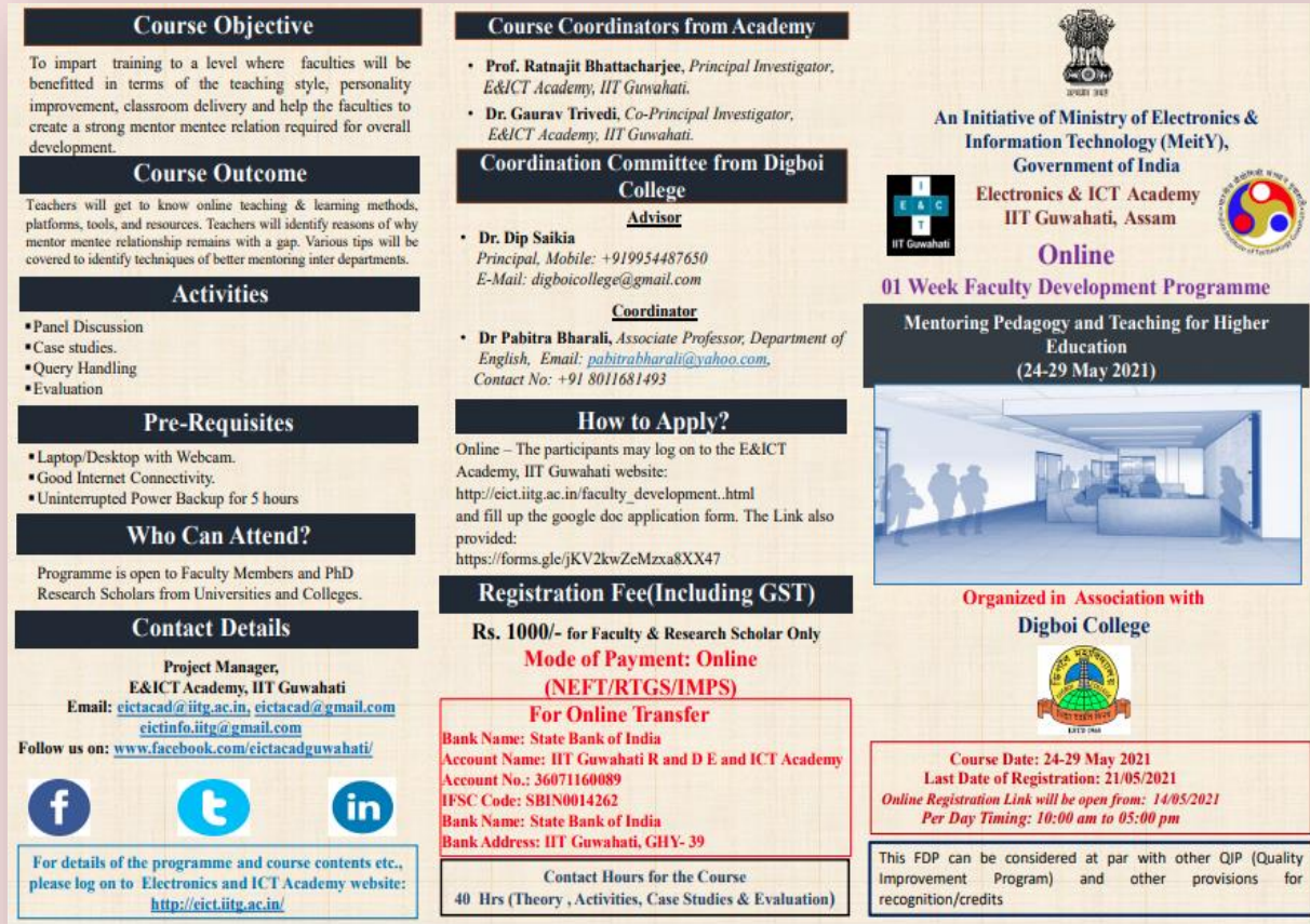
Attendance sheet of College Teachers' at Online FDP organised by E & ICT Academy IIT, Guwahati Course name - Mentoring Pedagogy and Teaching for Higher Education (24-29 May, 2021) Conducted by E&ICT IIT, Guwahati in association with Digboi College