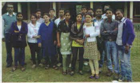
Field Trip on 24.02.2013 by Learners of Human Right Education Certificate Course