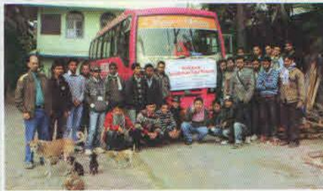
Educational Tour to Kolkata & Sunderban Tiger Reserve