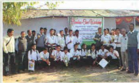
Cane and Bamboo workshop for boys on 11-14 february, 2013