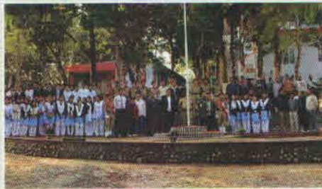
Republic Day Celebration, 2013