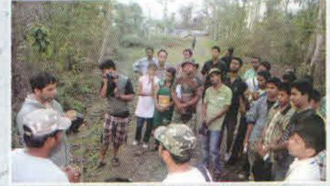
Camera trap photographic techniques for animal census training for students on 16.05.2013