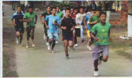
Marathon during college week