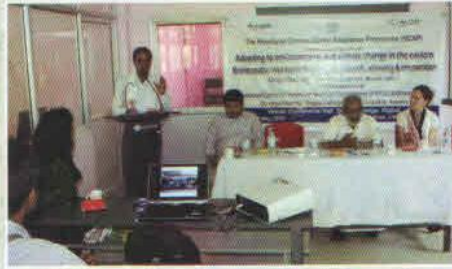
Climate Change and Food Security Programme on 08.05.2013