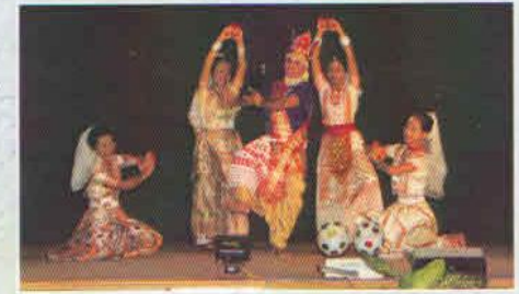
Cultural Programme at National Seminar on 7th & 8th October, 2013