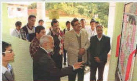
Inauguration of Boys hostel wall Magazine