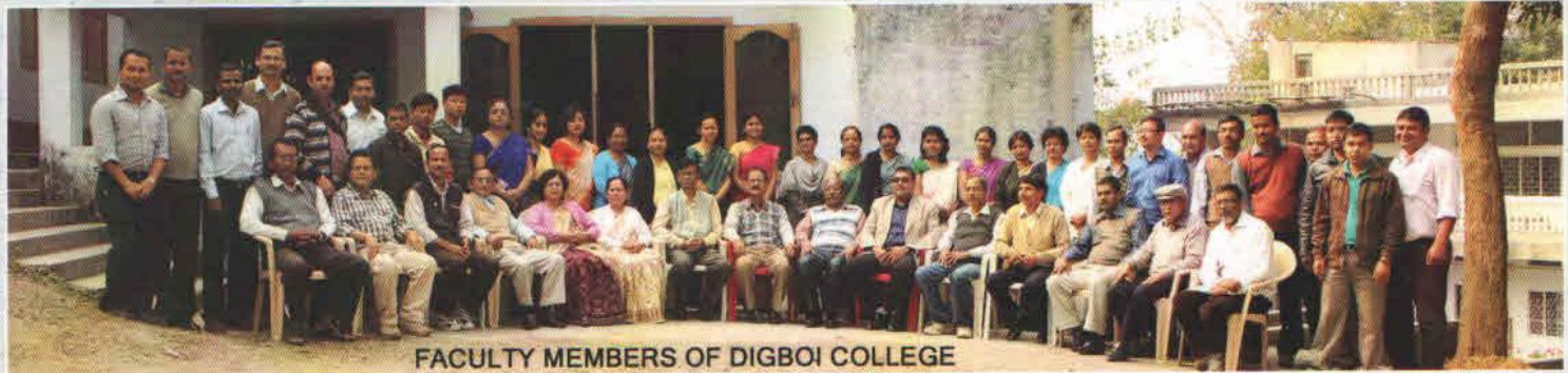
FACULTY MEMBERS OF DIGBOI COLLEGE