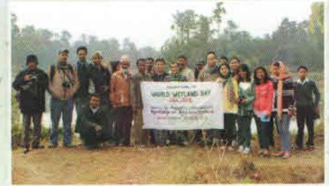
World Wetland Day Celebration at Digboi Oil Field on 2nd Feb, 2013