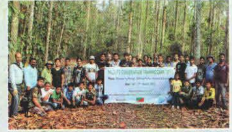
4 days Nature Training Camp for students at Dehing Patkai WLS on 25-27th March, 2013